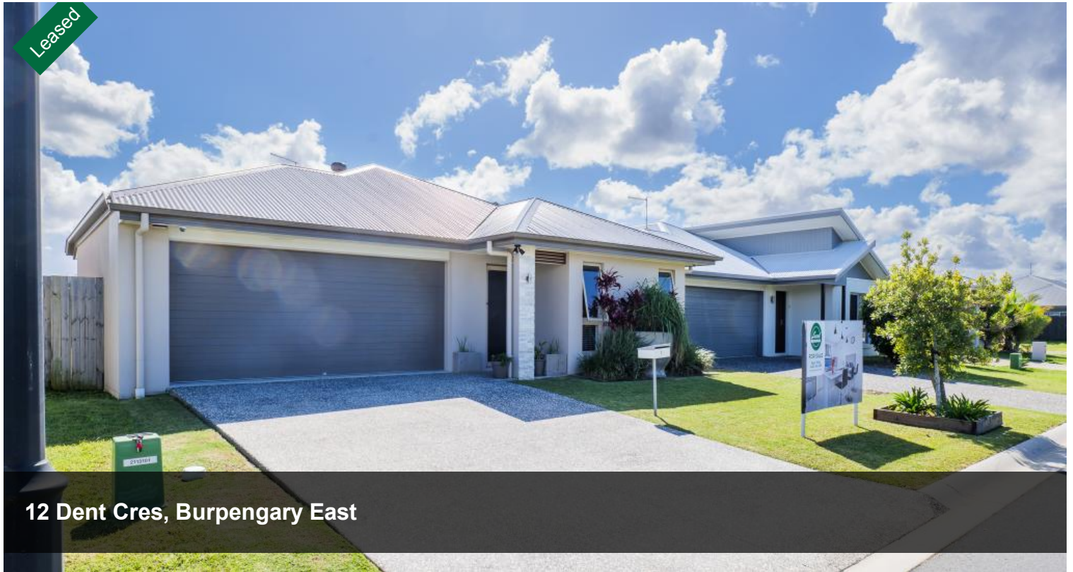
12 Dent Cres, Burpengary East