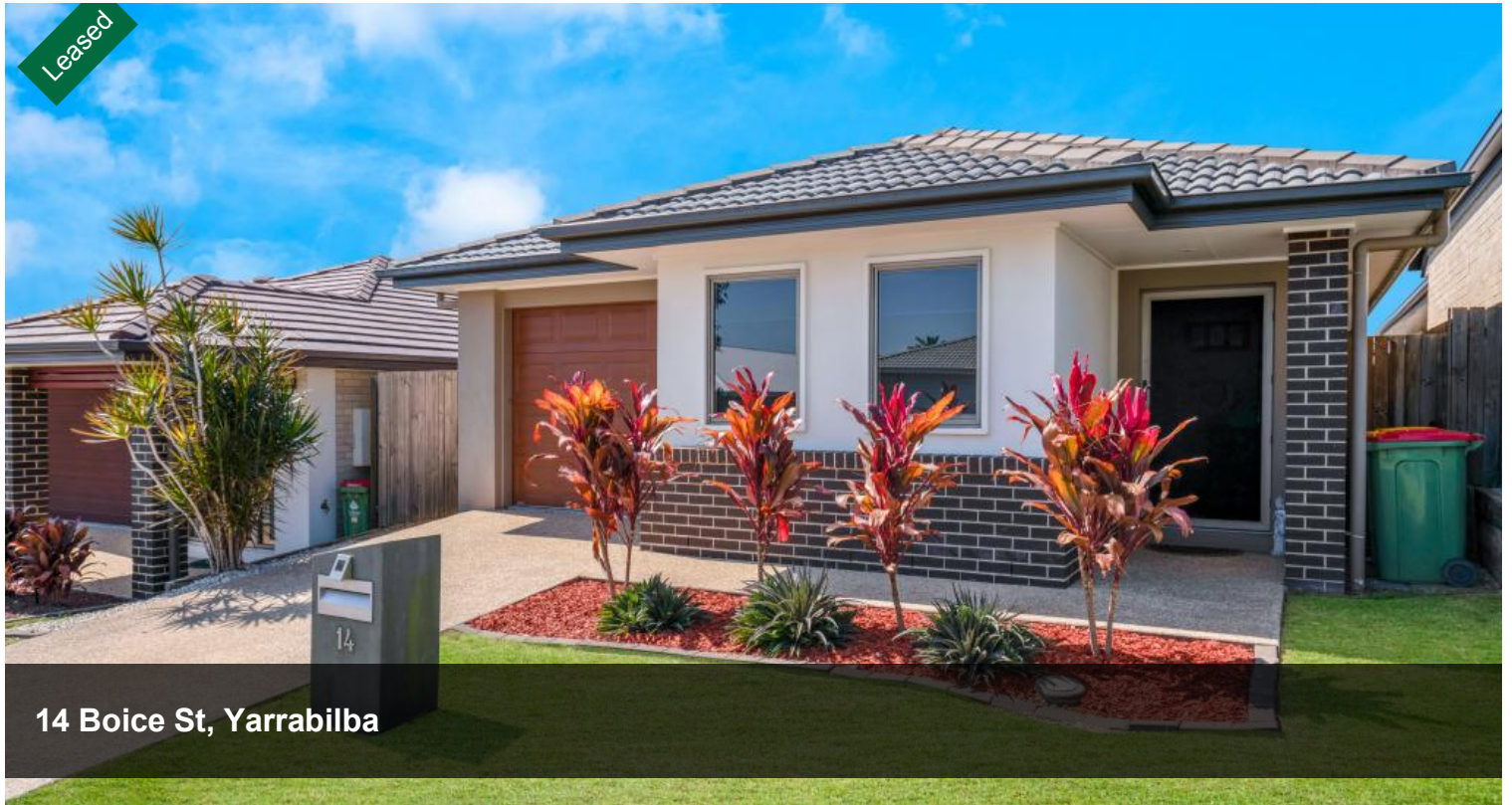
14 Boice St, Yarrabilba