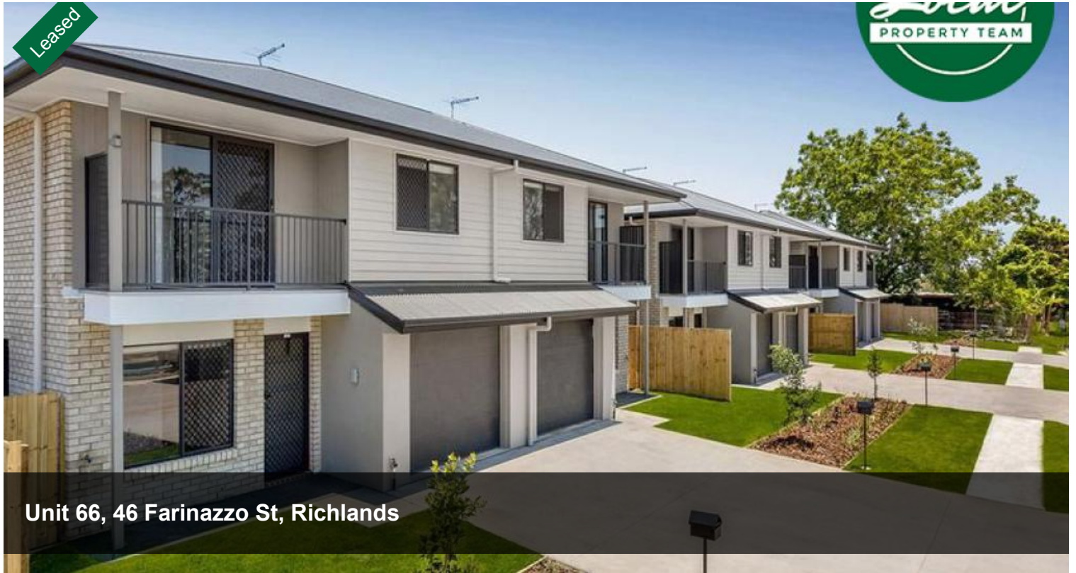
Unit 66, 46 Farinazzo St, Richlands