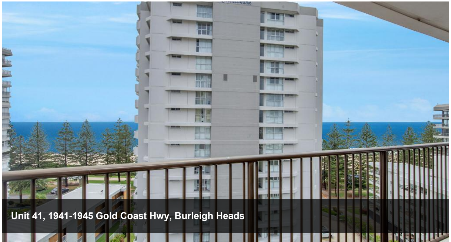
Unit 41, 1941-1945 Gold Coast Hwy, Burleigh Heads