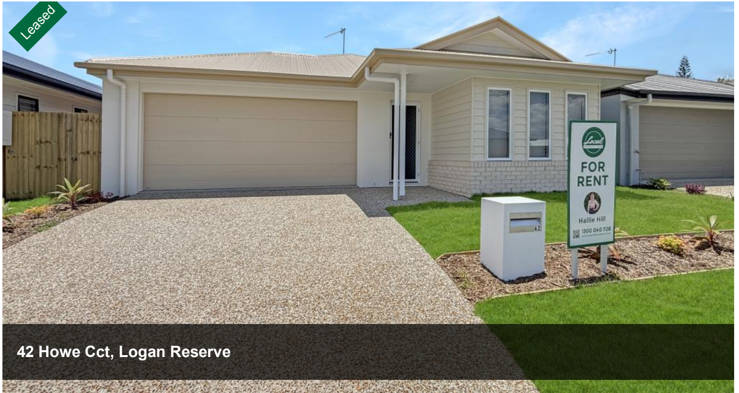
42 Howe Cct, Logan Reserve